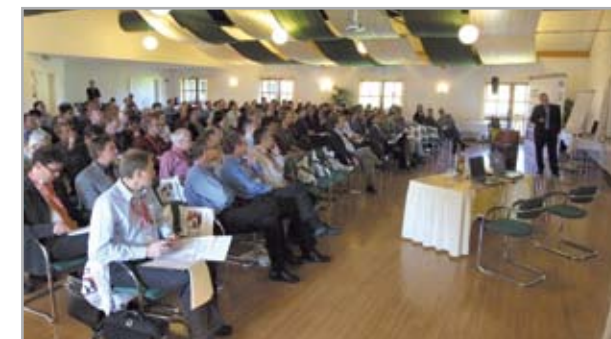
CST's 3rd European User Group Meeting in September 2007, Lake Tegernsee, Germany